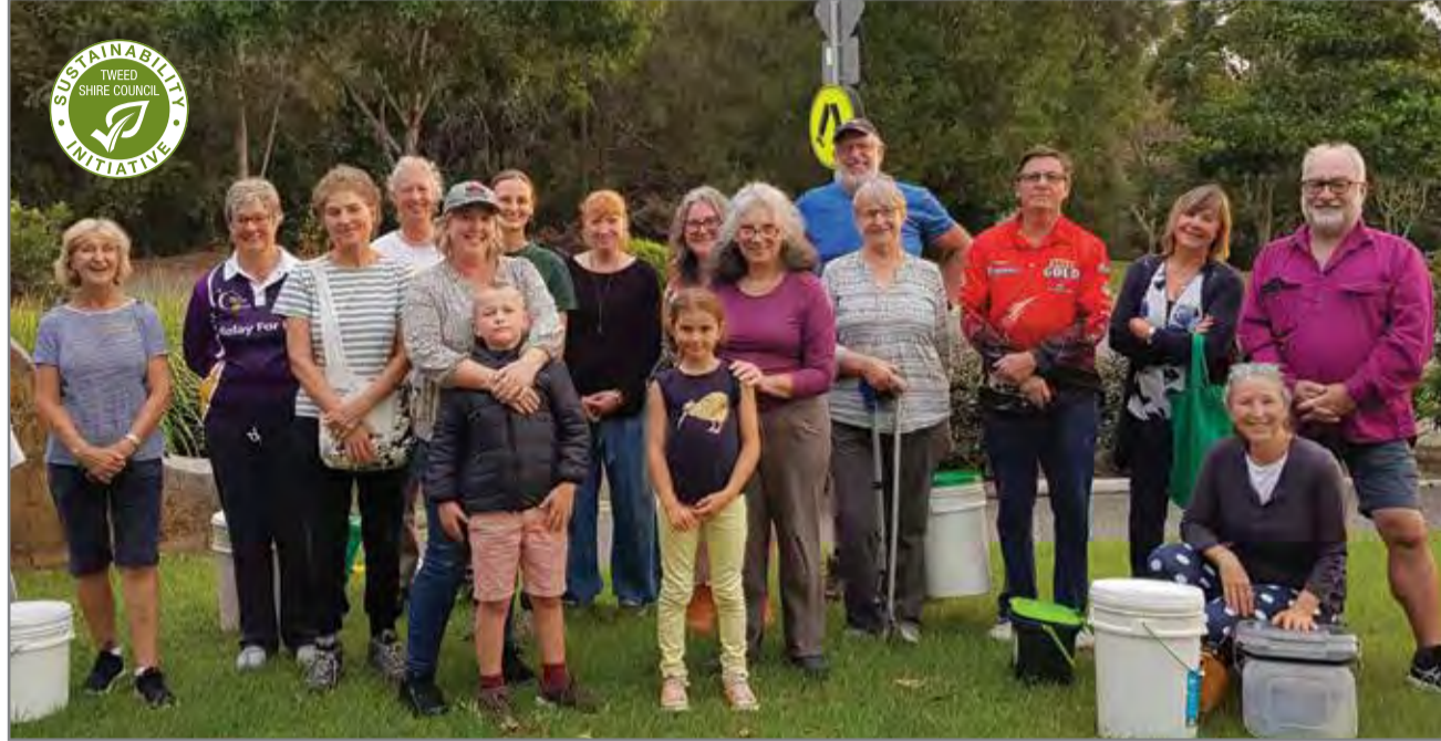
More than 2,000 cane toads were removed from the Tweed environment from September 2021 to April 2022. Well done volunteers!