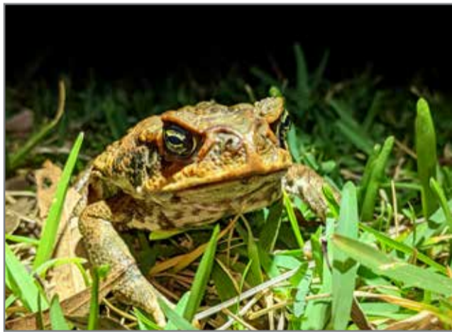
Let's make a difference, let's impact cane toads!

Find out more about Council's parks and gardens or search for a park across the Tweed at tweed.nsw.gov.au/parks-gardens . Read the full media release at tweed.nsw.gov.au/latest-news