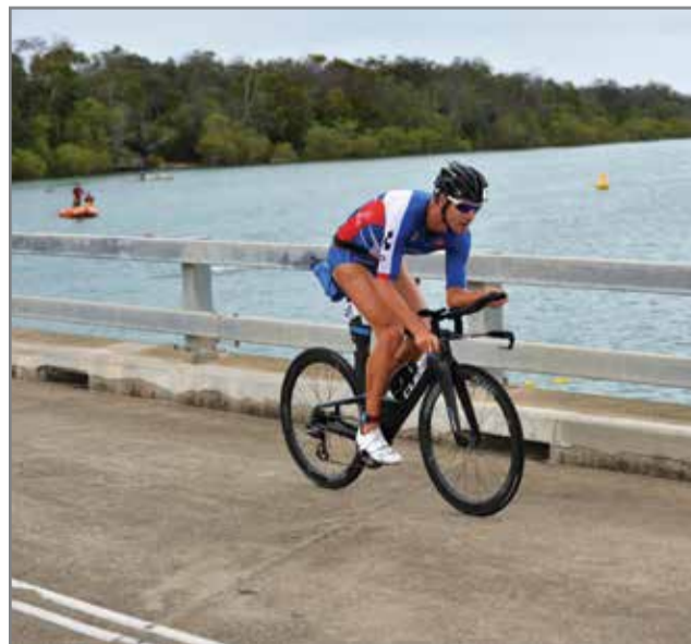
There will be impacts on roads and changed traffic conditions around Pottsville this weekend for the Tweed Enduro.

For detailed road information and timing, including a map, head to tweedenduro.org/roads and see the advertisement on the next page.