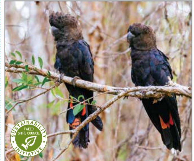
Come along to the free workshop to find out how you can join the count and protect these birds in the Tweed.

Visit glossyblack.org.au/great-glossy-count to find out more and register for either event.