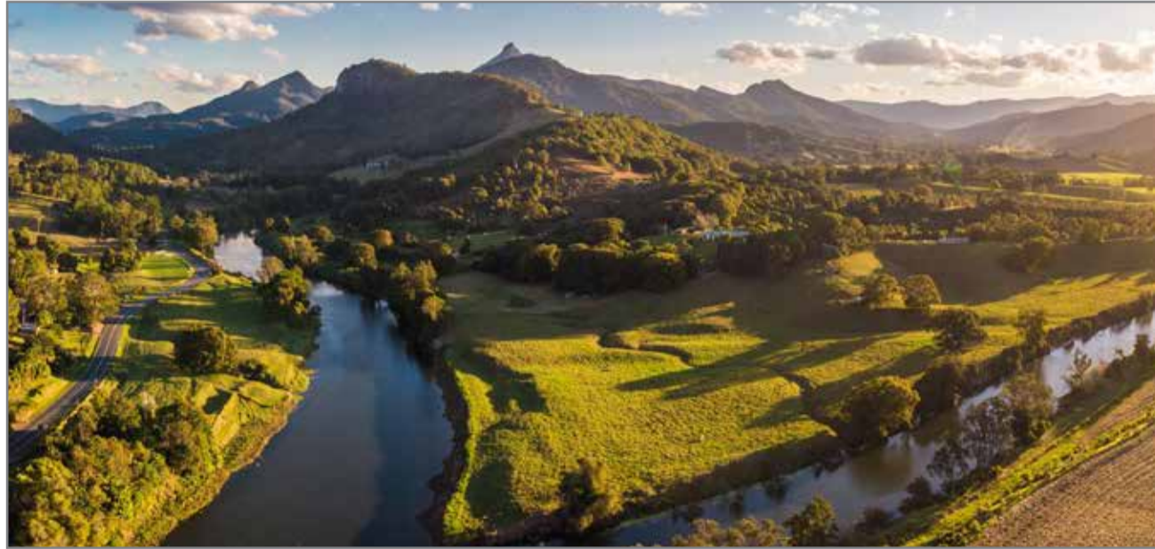
How did your local waterway score in Council's annual report card on water quality?

Tweed Shire Council wishes to recognise the generations of the local Aboriginal people of the Bundjalung Nation who have lived in and derived their physical and spiritual needs from the forests, rivers, lakes and streams of this beautiful valley over many thousands of years as the traditional owners and custodians of these lands.