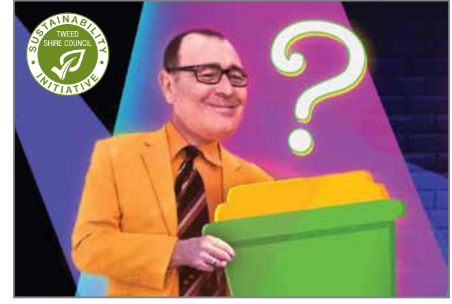
Join Reece Orse (get it?) for a fun online trivia night to celebrate National Recycling Week.

$425 worth of prizes are up for grabs! (Prizes are only for people who live in the Northern Rivers region).