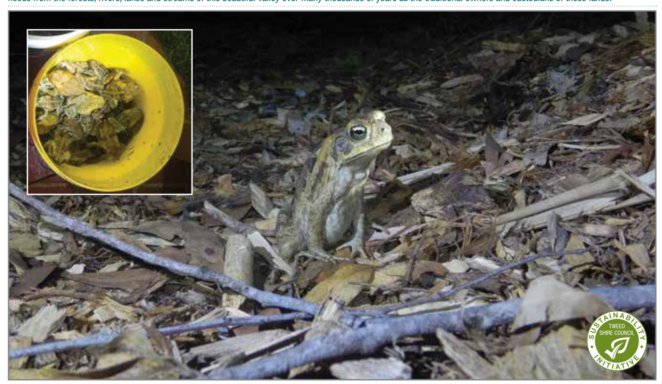
Cane toads (Bufo marinus) are infiltrating the Tweed (main) and inset, a bucket of toads collected at a recent toad busting event.

Tweed Shire Council wishes to recognise the generations of the local Aboriginal people of the Bundjalung Nation who have lived in and derived their physical and spiritual needs from the forests, rivers, lakes and streams of this beautiful valley over many thousands of years as the traditional owners and custodians of these lands