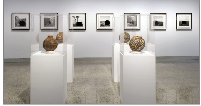
Void, installation view, Tweed Regional Gallery, 2021.

Businesses are encouraged to register their interest in the project at yoursaytweed.com.au/railtrail