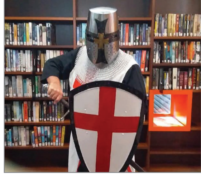
Sir Larry of the Library will make a special appearance at Kingscliff Library to mark its 21st birthday on Monday 28 June.

There will also be a limited amount of free craft handout for children. For more information contact Kingscliff Library on 02 6674 1607.