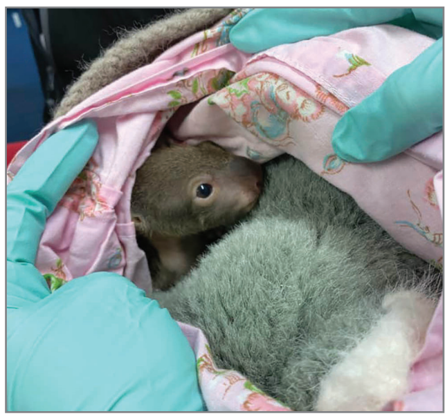
Koala joey Heath is being well cared for by staff at Currumbin Wildlife Hospital.

Report all koala sightings at tweed.nsw.gov.au/koalas