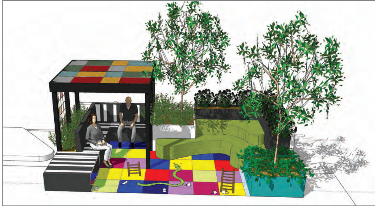
An artist's impression of what parklets planned for the streets of Murwillumbah's CBD may look like.

Tweed Shire Council wishes to recognise the generations of the local Aboriginal people of the Bundjalung Nation who have lived in and derived their physical and spiritual needs from the forests, rivers, lakes and streams of this beautiful valley over many thousands of years as the traditional owners and custodians of these lands.