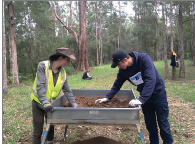
Cultural heritage excavations took place as part of the preparation work for the Environmental Impact Statement for the proposed raising of Clarrie Hall Dam.

The findings from the excavations will help in the development of an Aboriginal Cultural Heritage Management Plan for the project.