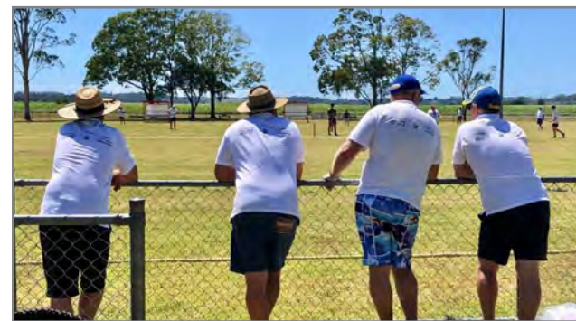
A community event supported by Australia Day event funding from Tweed Shire Council.

To be eligible, events must be held on Australia Day (26 January 2021) and be a public event.