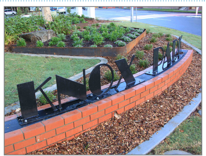
The upgrade includes art deco-style entry signage.

For more information visit www.tweed.nsw.gov.au/knoxparkupgrade and check out Council's Facebook page for more photos of the