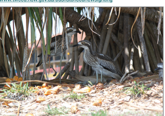
Report sightings of Bush Stone-curlews to increase local knowledge of this endangered bird.

www.tweed.nsw.gov.au/bushstonecurlewsighting