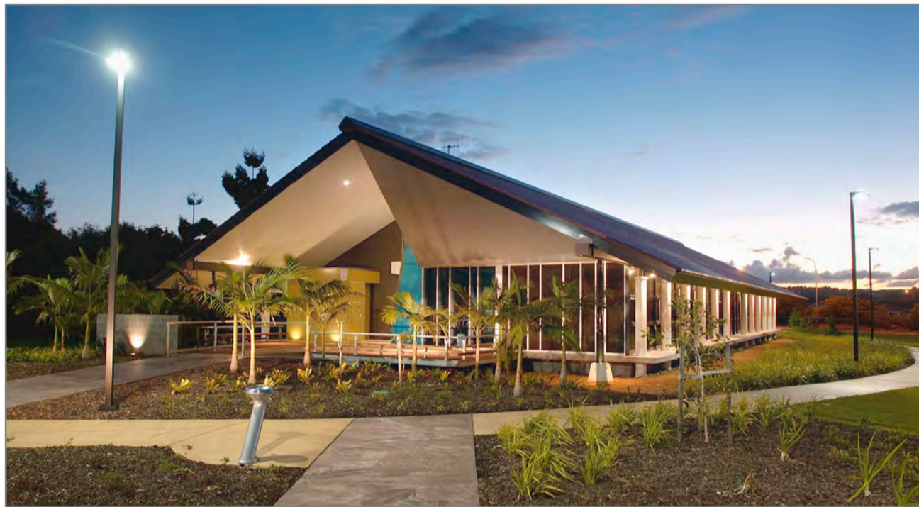
The Fun Activities for Banora Seniors (FABS) program has been suspended at Banora Point Community Centre, which has now closed.

The information in the issue of the Tweed Link was correct at the time of going to print and is provided in good faith. For the most up-to-date information on Council services during the Coronavirus (COVID-19) situation, visit www.tweed.nsw.gov.au/coronavirus For information on COVID-19, visit NSW Health www.health.nsw.gov.au or healthdirect www.healthdirect.gov.au For information on NSW government restrictions, go to preview.nsw.gov.au/covid-19