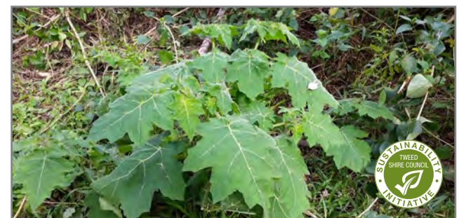
Have you seen the tropical soda apple plant?

Also check with the Fire Control Centre on (02) 6671 5550 to see if you need a Bush Fire Hazard Reduction Certificate and ensure you have sufficient equipment to control and contain the fire to your property.