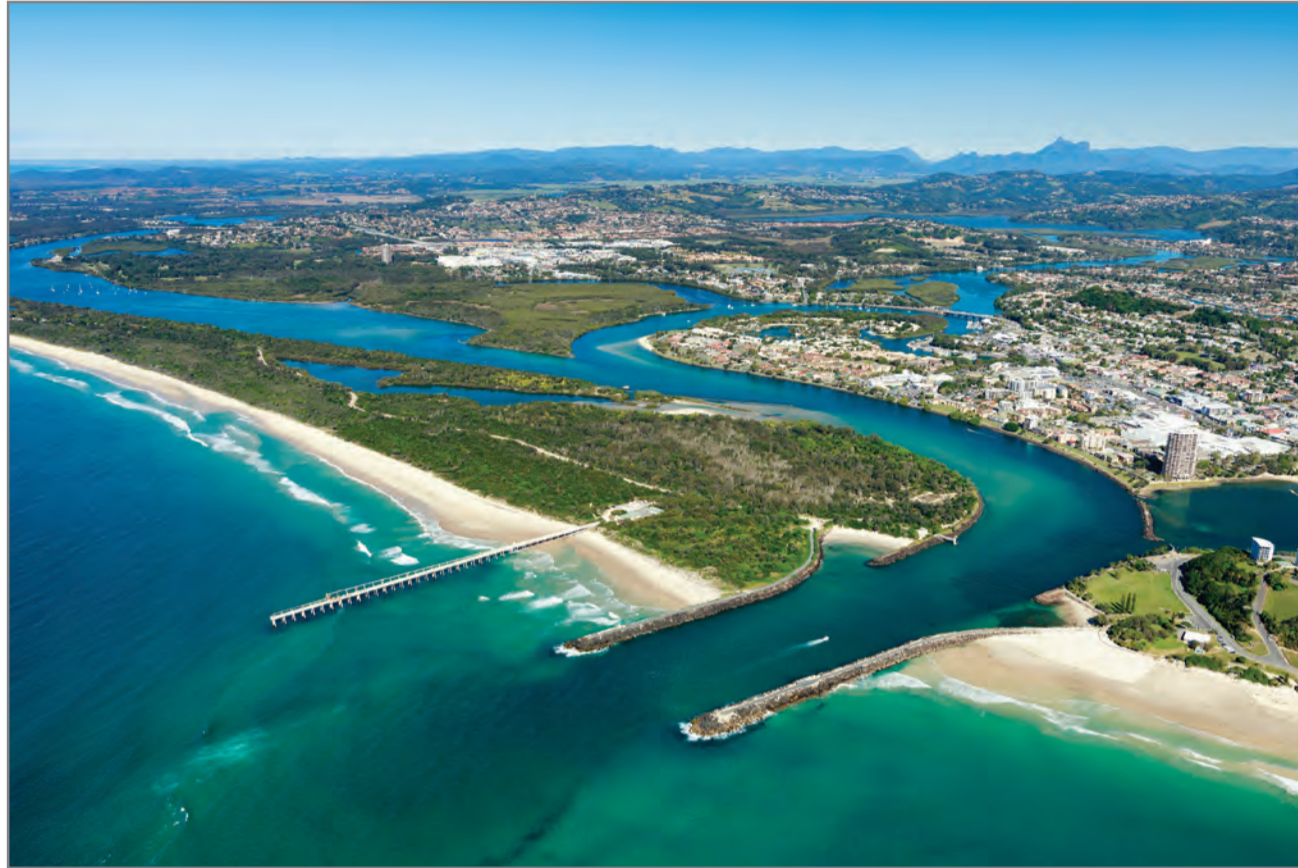
The draft Local Strategic Planning Statement aims to define how growth and change in the Tweed will be managed into the future.

Tweed Shire Council wishes to recognise the generations of the local Aboriginal people of the Bundjalung Nation who have lived in and derived their physical and spiritual needs from the forests, rivers, lakes and streams of this beautiful valley over many thousands of years as the traditional owners and custodians of these lands.