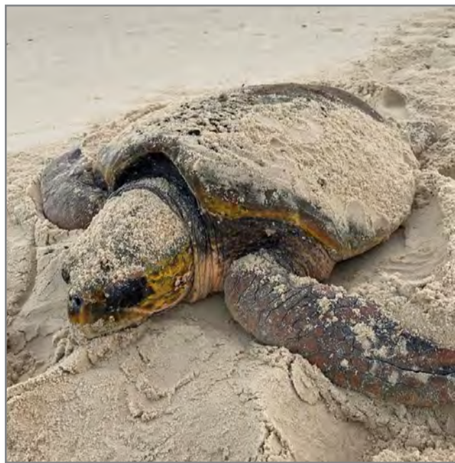
A loggerhead turtle nested on the Tweed Coast over the Australia Day long weekend.

Sea turtle hatchlings are beginning to emerge from their nests across the Tweed and a free information session for the community will help ensure as many hatchlings make it to the ocean as possible.