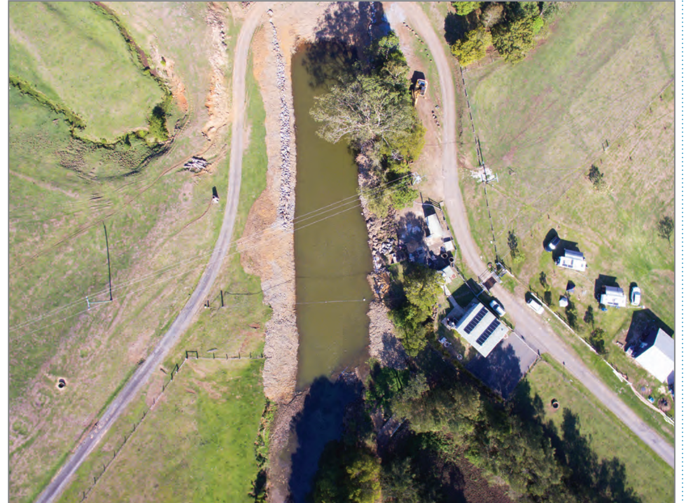
An aerial view of the upgraded Tyalgum weir pool.

Tweed Shire Council wishes to recognise the generations of the local Aboriginal people of the Bundjalung Nation who have lived in and derived their physical and spiritual needs from the forests, rivers, lakes and streams of this beautiful valley over many thousands of years as the traditional owners and custodians of these lands