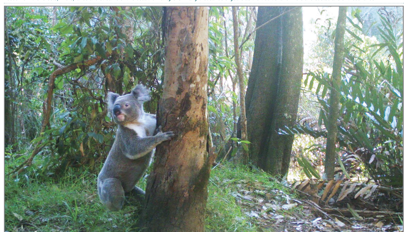
One of our local Pottsville koalas captured on the move between trees through our remote camera monitoring program.

Tweed Shire Council wishes to recognise the generations of the local Aboriginal people of the Bundjalung Nation who have lived in and derived their physical and spiritual needs from the forests, rivers, lakes and streams of this beautiful valley over many thousands of years as the traditional owners and custodians of these lands