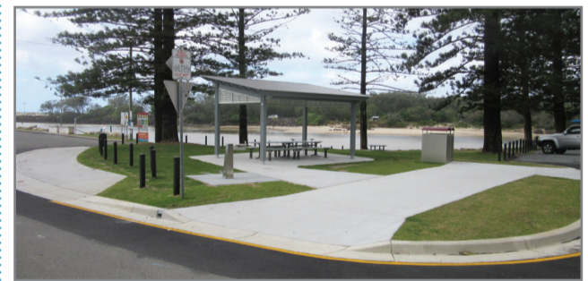
Small changes have made for a big impact at popular Faulks Park at Kingscliff.

Meet the Street (River Street) and kick start South Murwillumbah Flood Levee Repair – to kick off construction of the South Murwillumbah Flood Levee repairs, Council invites the residents of River Street to meet their neighbours and the wider South Murwillumbah community at this Meet the Street morning tea. RSVPs required for catering purposes.