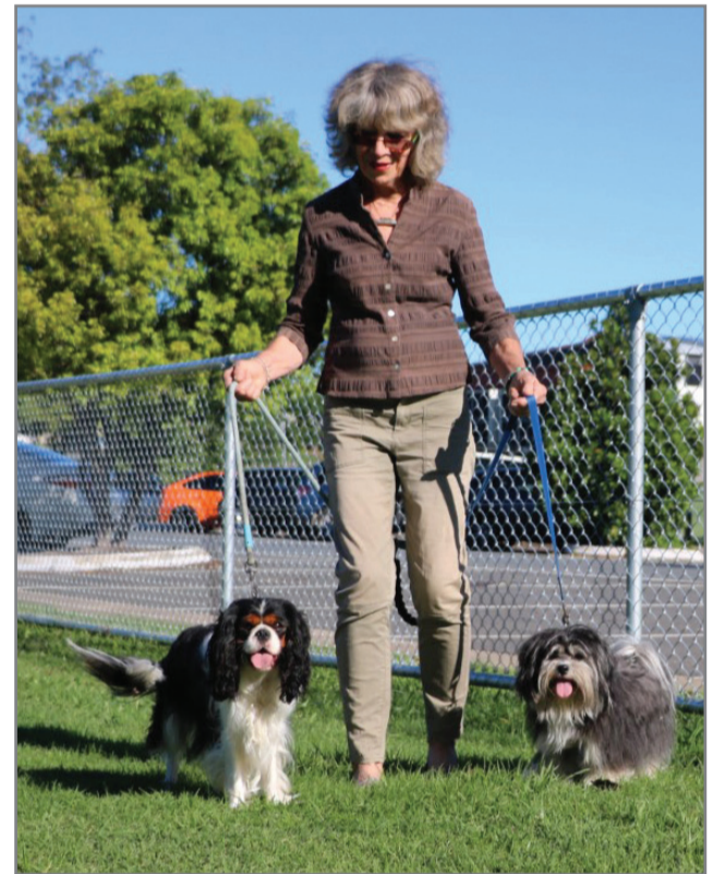
A new fenced-off, off-leash dog park in Murwillumbah is one of the options you can vote for if you live in the Lismore electorate.

Farmers who are interested in working on projects that have a direct and positive impact on the environment and the way they farm are encouraged to apply. Download the application form and grant guidelines at www.tweed.nsw.gov.au/agriculture