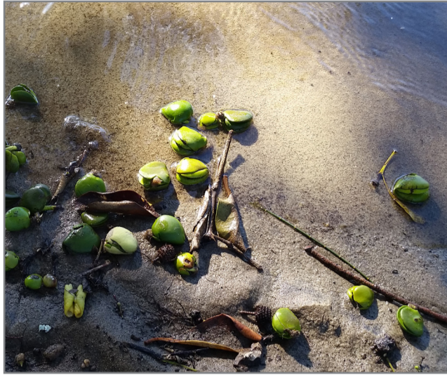
The fruit of the grey mangrove is causing a stink as it rots.

Council has received numerous calls from residents around Terranora Inlet (particularly the Cobaki Broadwater Village), The Anchorage and Oxley Cove reporting suspected sewer leaks causing a persistent foul odour in residential areas.