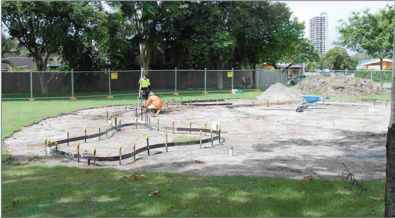
The new playground takes shape at Eunga Street Park, Tweed Heads South.