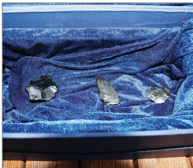
The Māori artefacts consisted of three tools made from obsidian glass – a three-sided scraper and two bi-faced scrapers.

The best specimens from the remaining Adrian Smith Collection are on permanent display at Tweed Regional Museum Murwillumbah, including 500 minerals and 300 gemstone specimens.