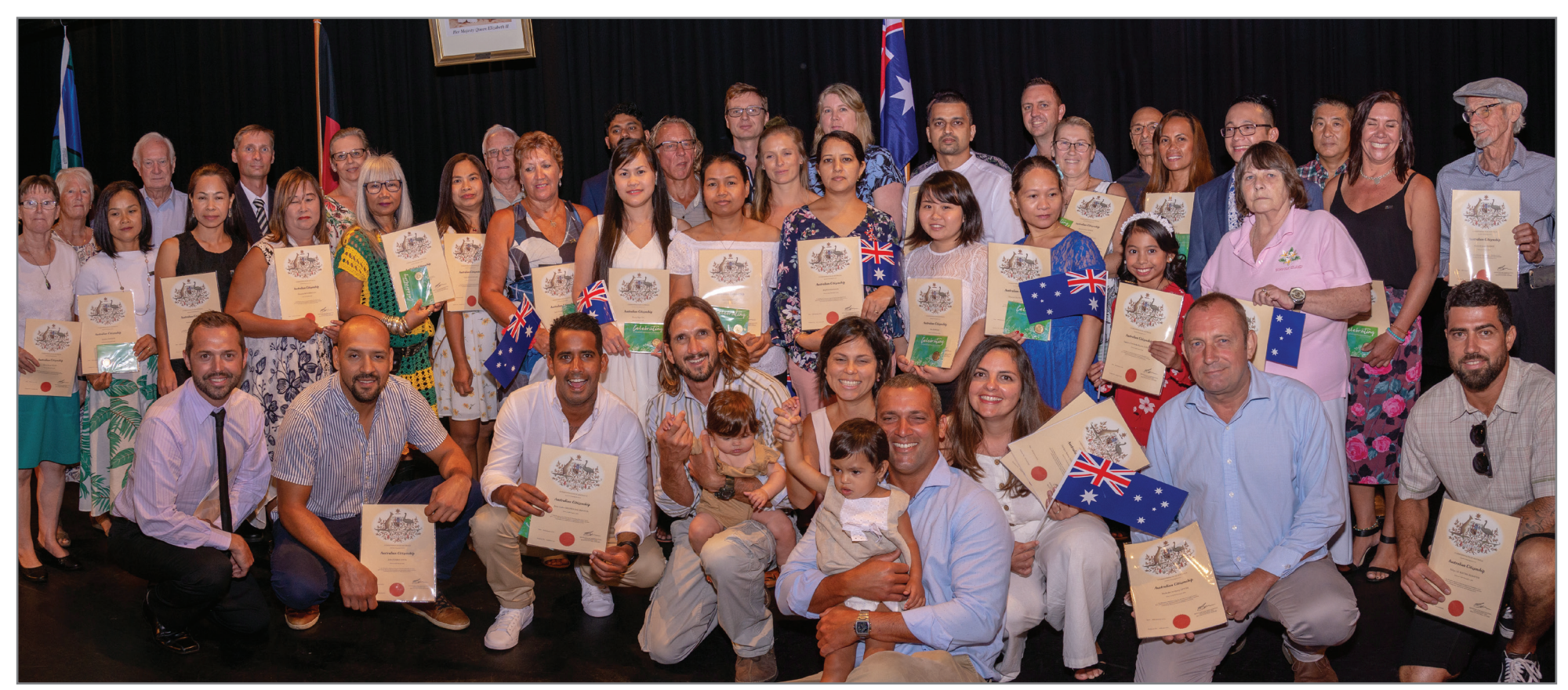
Congratulations to all our new Australian citizens who call the Tweed home.