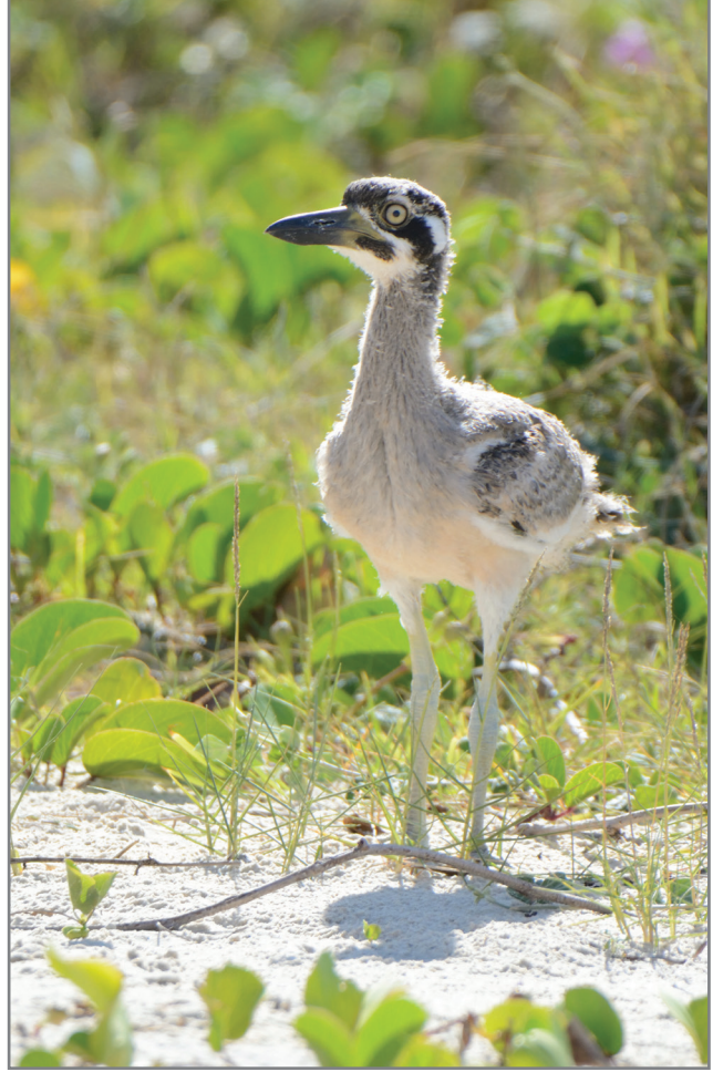
The little Beach Stone-curlew has certainly grown.

"I think we have many bird watchers in the making," she said. Find out more about beach nesting birds on our website www.tweed.nsw.gov.au/BeachNestingBirds