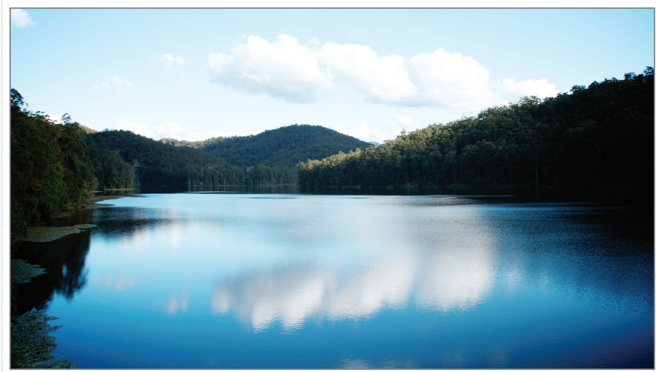
Council consultants assessing the potential impacts arising from the proposed raising of Clarrie Hall Dam have identified the Doon Doon catchment as an Aboriginal cultural landscape.

Council and its consultants will continue to work closely with the RAPs as this project progresses.