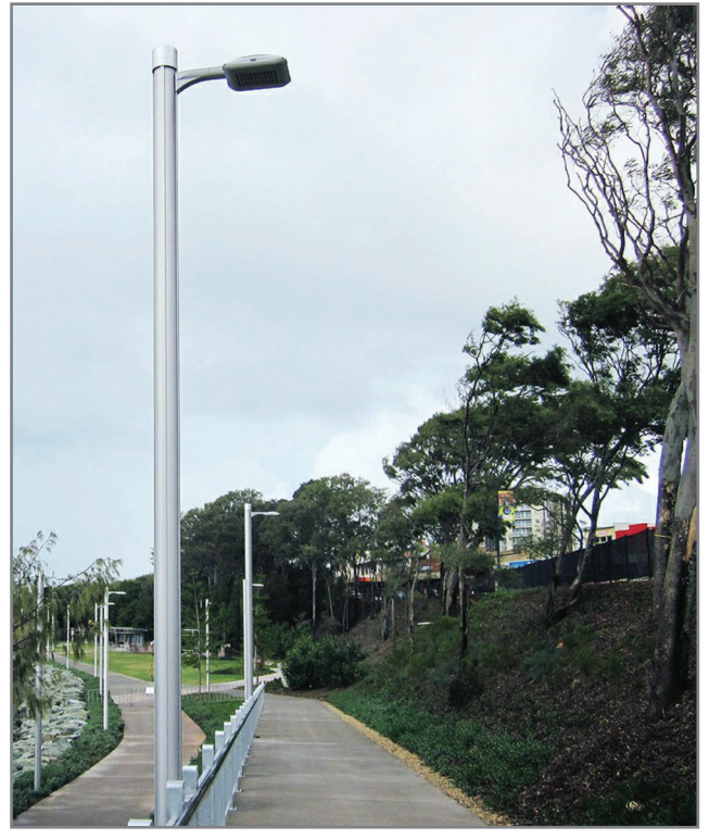
An example of the light poles to be installed from Cathedral Court south to Dryandras Court.

luminosity, can be individually adjusted via remote control and dimmed by up to 80 per cent. The light will face the beach and a visor can be fitted to minimise light spill to nearby houses where required.