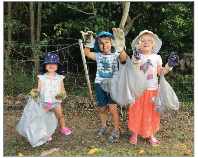
We can all do our bit for the environment by registering and particiapting in Clean Up Australia Day.

on the roof of the Mechanical and Electrical depot at Chinderah. All up, Council will add 570kW of solar generation capability to its assets this year providing community leadership in adopting renewables and modelling our commitment to take responsible action on climate change.