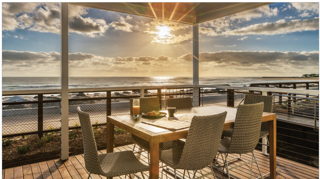
The view from one of the beachfront cabins at the award-winning Tweed Coast Holiday Parks Kingscliff Beach.

To book your getaway at Tweed Coast Holiday Parks Kingscliff Beach or any of the parks visit tchp.com.au