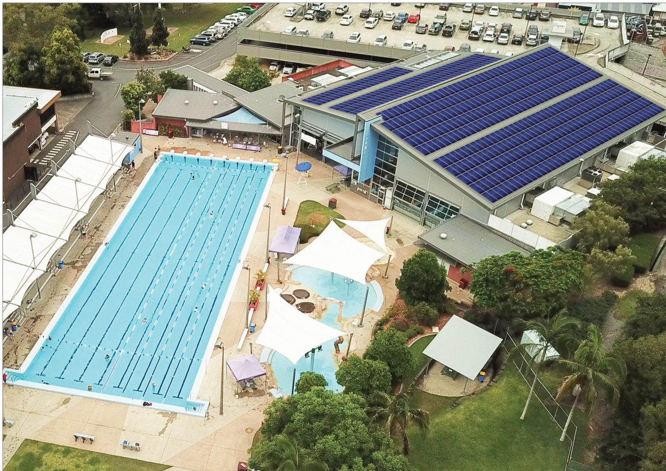
Artist's impression of the proposed solar panel layout at the Tweed Regional Aquatic Centre, Murwillumbah.

For more information, visit citiespowerpartnership.org.au