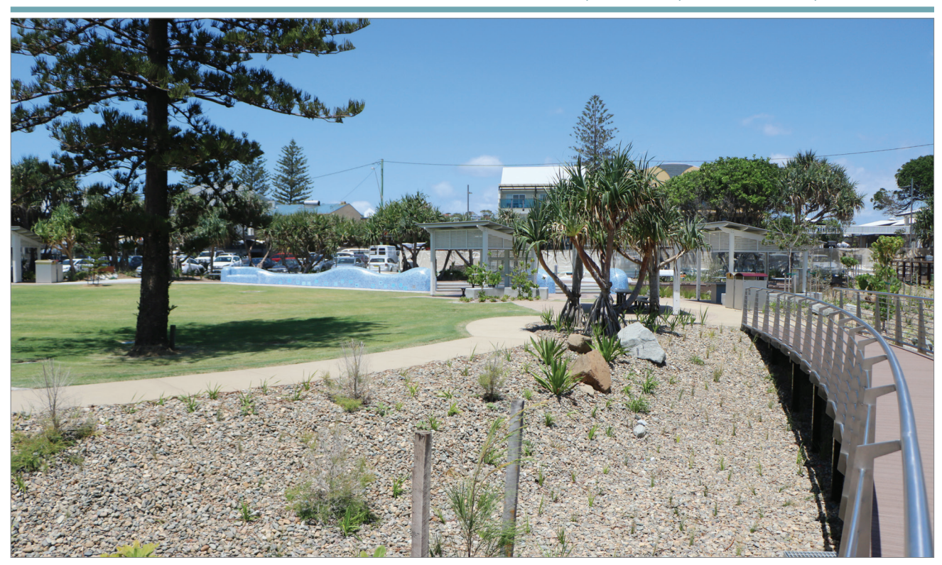
The new Kingscliff park has been named after local veteran, Sapper Rowan Robinson.

(02) 6670 2400 or 1300 292 872 | Issue 1042 | 20 February 2018 | ISSN 1327-8630