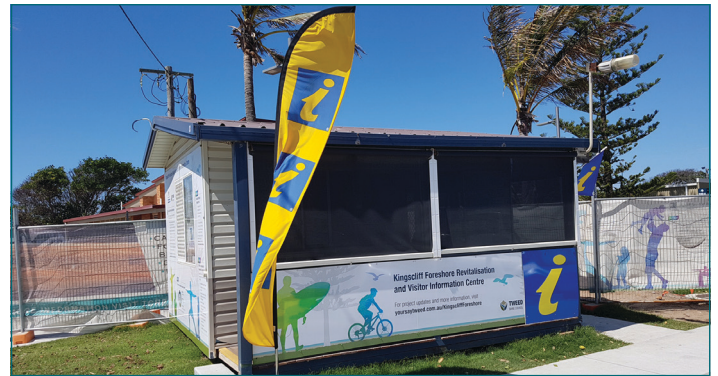
Kingscliff's temporary visitor information centre located on Marine Parade during the Kingscliff Foreshore Revitalisation Project.

The Kingscliff VIC is in its temporary home on Marine Parade, looking