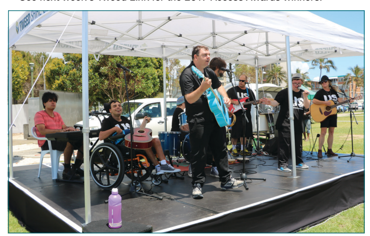
The US Band from Lifebridge got the crowd dancing at the first Festival of Belonging in the Tweed last Thursday.

See next week's Tweed Link for the 2017 Access Awards winners.