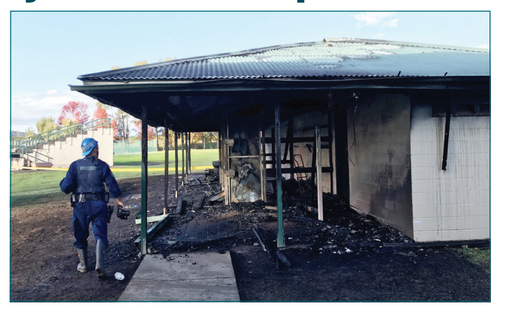
Forensic police inspect the remains of the burnt-out building.

\label{eq:multiple_def} \mbox{Murwillumbah Cricket Club, which fields junior and senior teams in the}