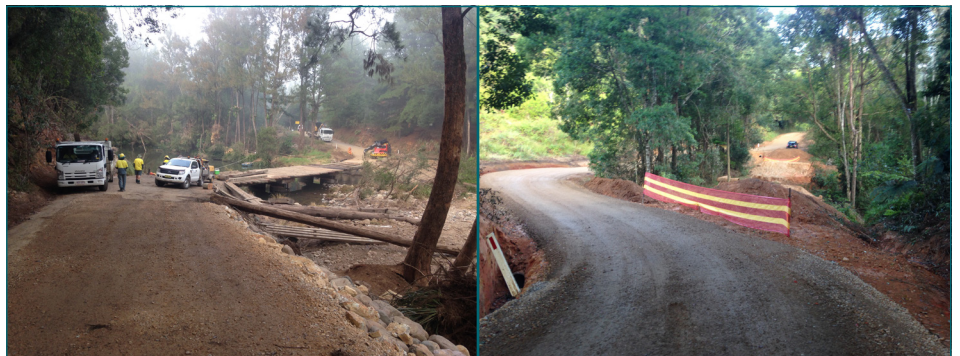
Council workers at the Byrrell Creek Bridge site (left) salvaged most of the original structure allowing them to finish the work in a shorter time than expected. The restored Manns Road in Rowlands Creek (right) is open for access, but caution is required.

To allow crews to join the through access in some sections, culverts have been widened and roads dug into banks. Some of the work still required will be major repairs that will result in delays and disruptions to access from time to time. Council will keep motorists and residents up to date on further work and anticipated interruptions.