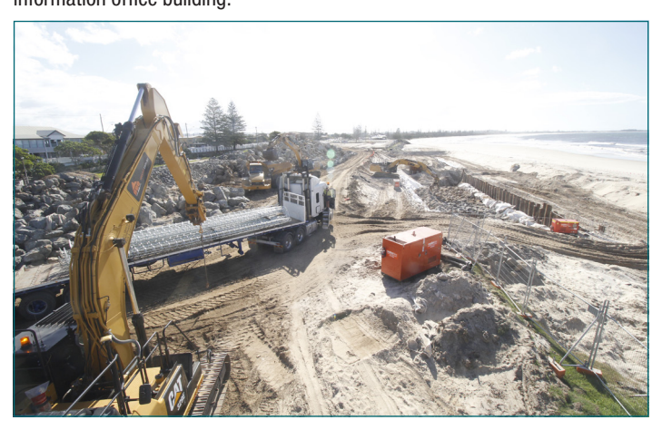
Laying the initial rock bed at the northern end of the site.

www.yoursaytweed.com.au/KingscliffForeshore and in the Tweed Link. Project information and updates will also be displayed on the outside of the information office building.