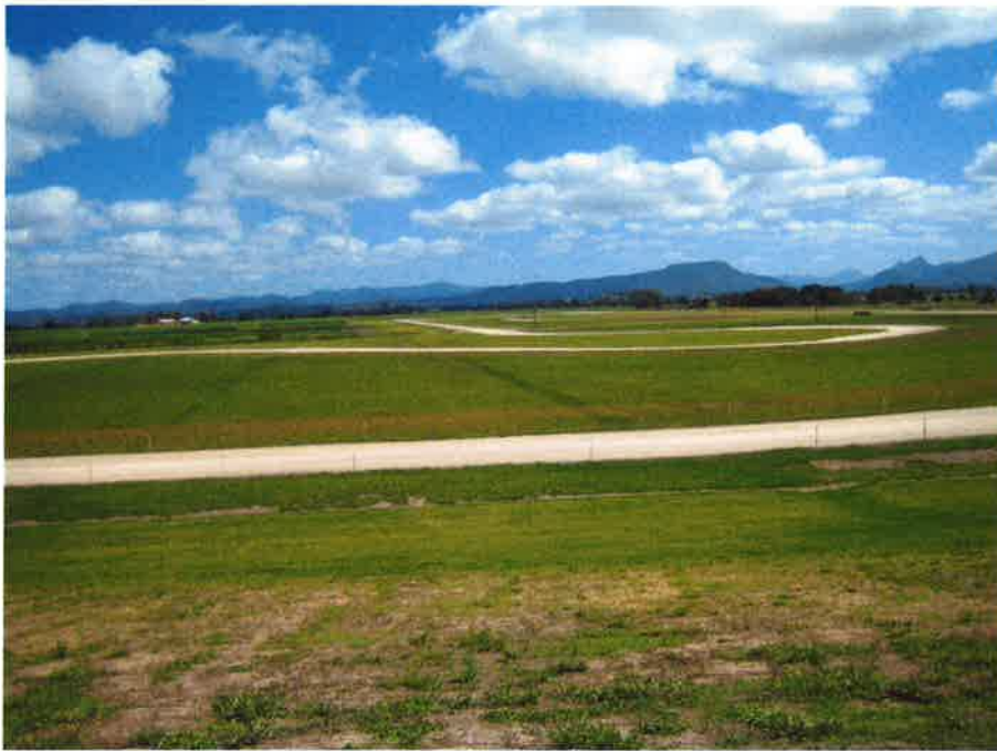
Photograph 1 – The subject farm road, viewed from the west on 1 February 2014