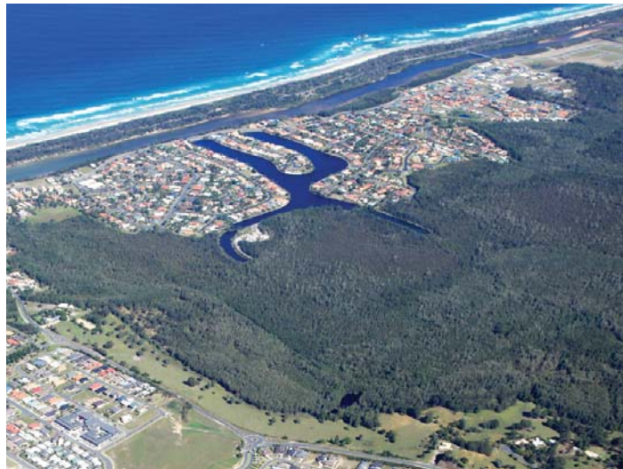
The Pottsville Wetland, covering nearly 300 hectares, is surrounded by urban and rural residential development.

native plants, 104 environmental weeds have also been recorded in and on the edges of the wetland. Many of these weeds, like arrowhead vine, night blooming cactus, orange jessamine and sky flower have escaped neighbouring backyards. Weeds compete with native plants and prevent the natural regeneration of the forest.